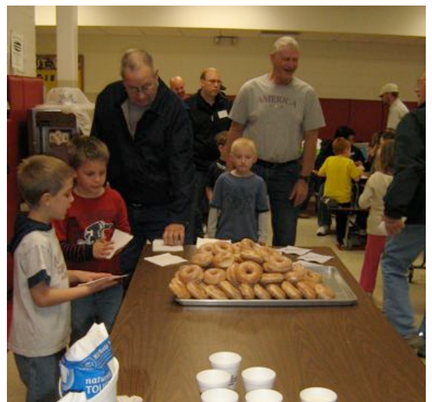
Donuts with Dad: The donut/milk line was a busy one!