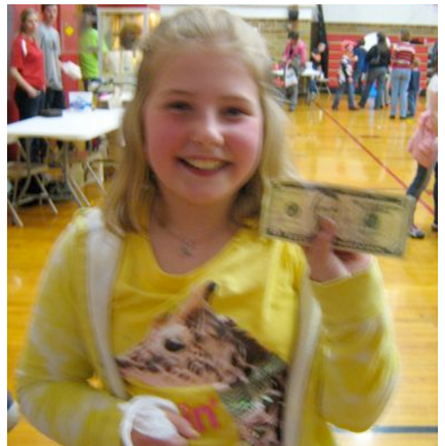
Everyone wins at the Carnival!