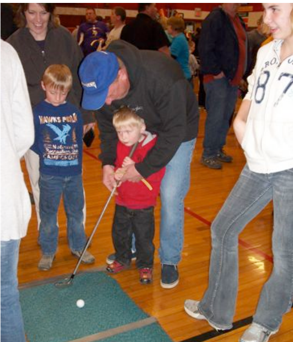
Dad stepped in to help putt this ball.