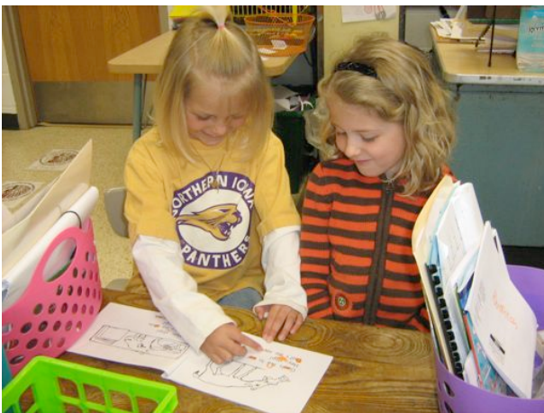
Two kindergarten students partner read