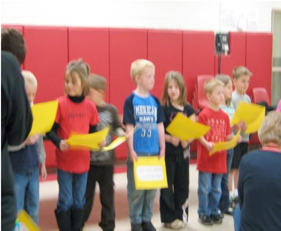
The students above are pictured reading a version of If You Give a Mom a Muffin

Both events were huge successes. We thank the parents for coming out and participating in these events. We also want to thank Kwik Trip for providing the food and beverages.