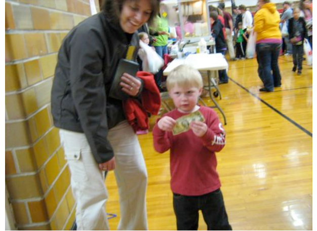
Hey, Mom! I won a dollar bill! Is it real?