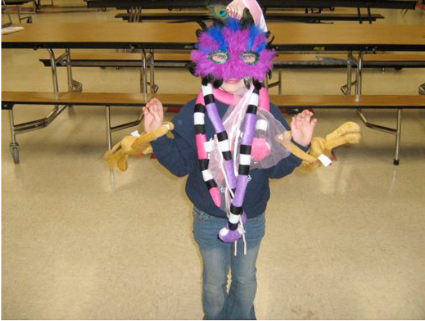
Guess who is all decked out with prizes from the Carnival?