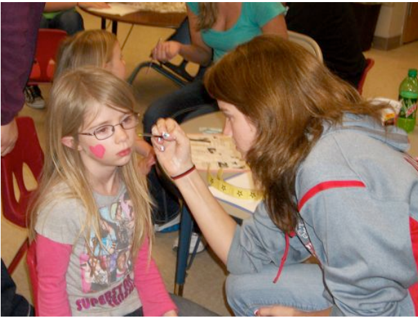
There were lines of children waiting for the face painting experience.