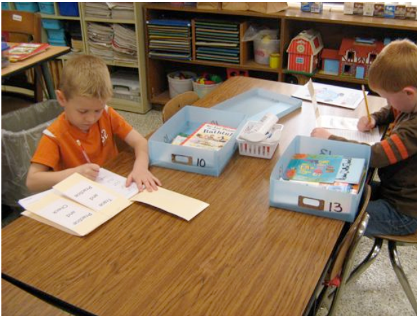
Kindergarten students engaged in a writing activity.

I love going to the Kindergarten classrooms these days and watching the students read to self and partner read. They can tackle any and all words. Their writing skills are amazing. These pictures show their literacy maturity.