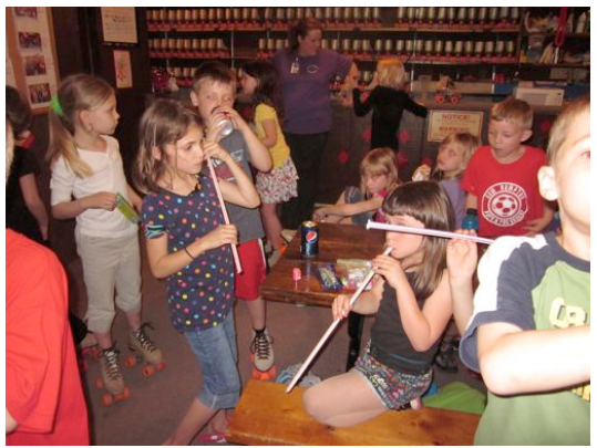
Food Fest: These NHE students are at the Pre-Carnival Skating Party. I know! It looks like they are at a food fest!