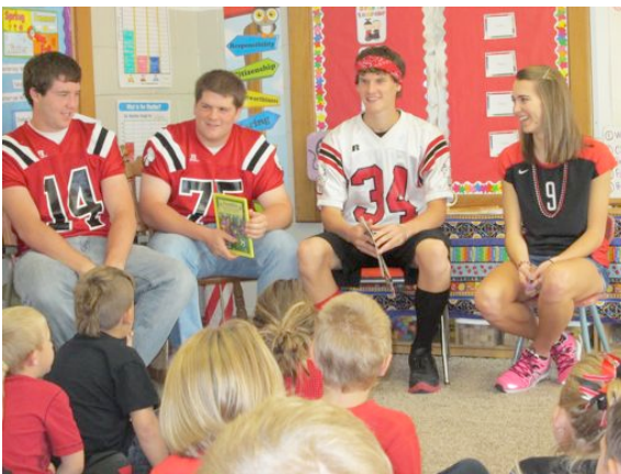
Celebrity Readers: After the high school athletes shared a story with the students, they told them a bit about the sport in which they were involved and then answered any questions students had.