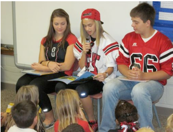
Celebrity Readers: First grade students were listening so well they didn't even hear me come into the room to take a picture.