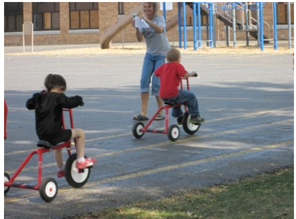
Go Red Power: The preschool students demonstrated red power in a trike race.