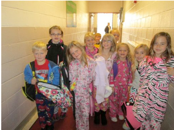
Pajama Day: These students forgot to get dressed on Wednesday morning of Homecoming Week. They came to school in their pajamas.