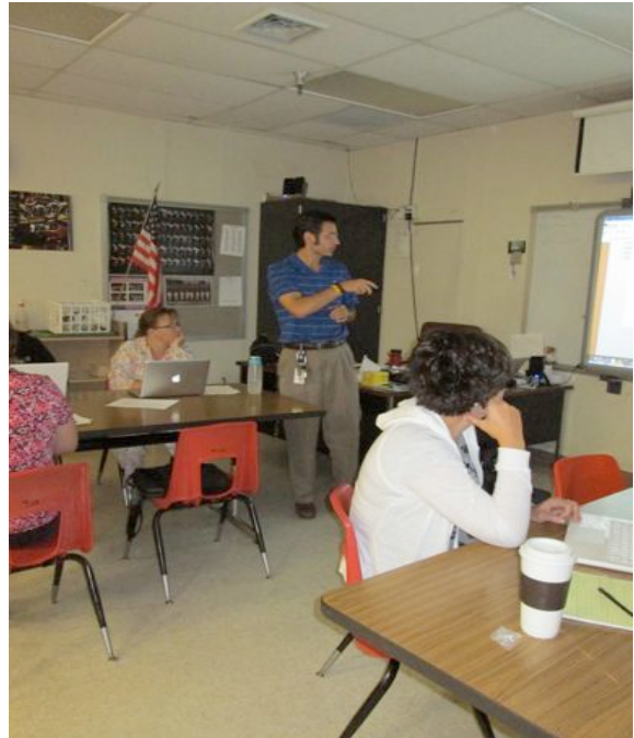
Late Start Technology Training: Teachers enjoyed the help of district technology facilitators while they worked on webpage design.