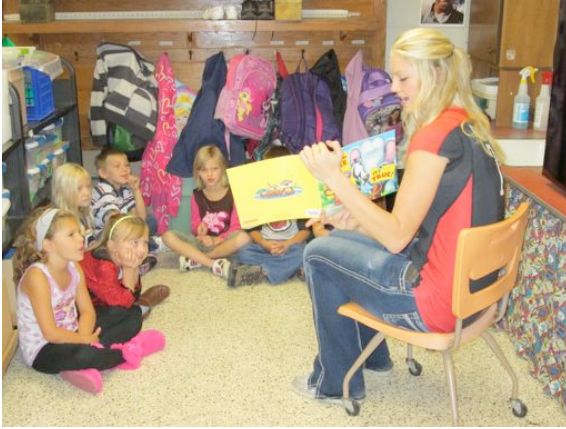
Celebrity Readers: Kindergarten students enjoy a story read by a high school basketball player and a Homecoming Queen Candidate.