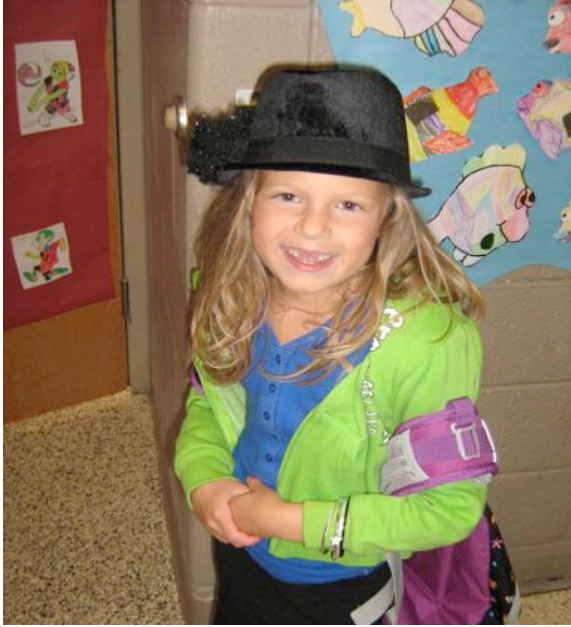
Homecoming Week: Hat Day During Homecoming Week is always a fun day for the students.