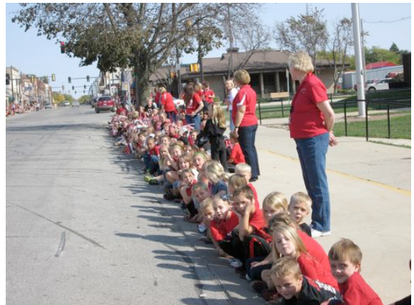
Homecoming Parade: The Street In Front Of NHE was lined with students eagerly waiting for the parade to start. The weather was perfect and everyone had a wonderful time.