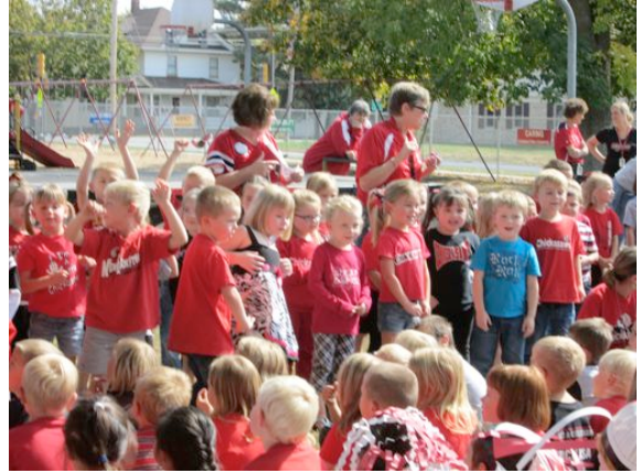
Go Red Power: Each grade level shared a cheer and involved everyone in the chant at the Homecoming Assembly.