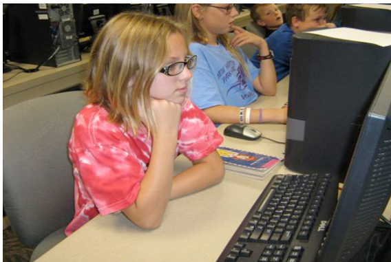
Concentration and Focus: It takes a great

As you can see above the mean score for NHE students at each grade level is above the NWEA norms in all content areas