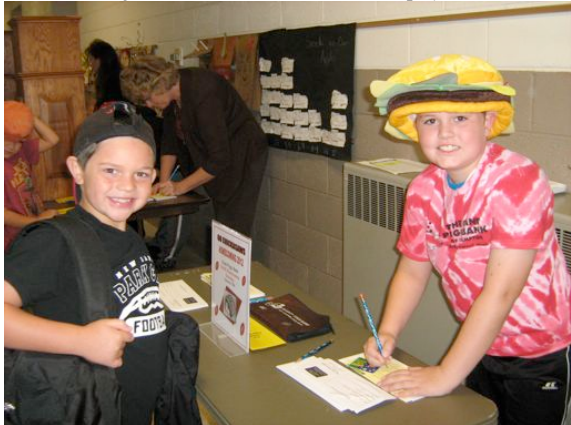
Hats On! Everyone enjoyed wearing hats to school on Tuesday of Homecoming Week, even the student bankers of the Giant Piggy Bank.