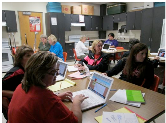
Late Start Activities: Teachers truly enjoyed the time to develop their webpages.