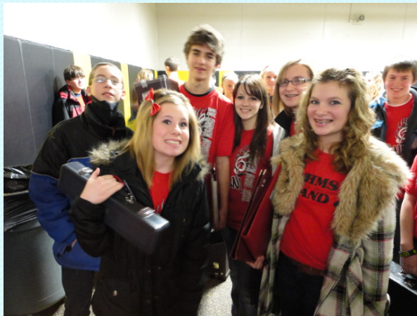
Band Contest in Waverly