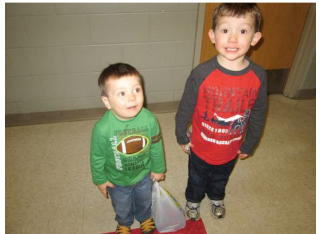
I couldn't resist taking this picture. In fact, I followed this family out in the hallway and asked if I could take a picture of the two boys. The little one had such a full sack, he couldn't lift it so was dragging it.