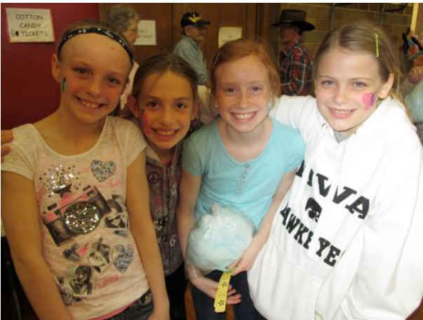
These fourth graders were glad to show off their face artwork.