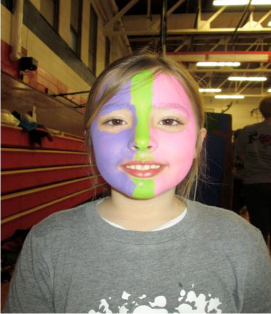
The smile on this face tells you how she feels about the green streak down the middle!