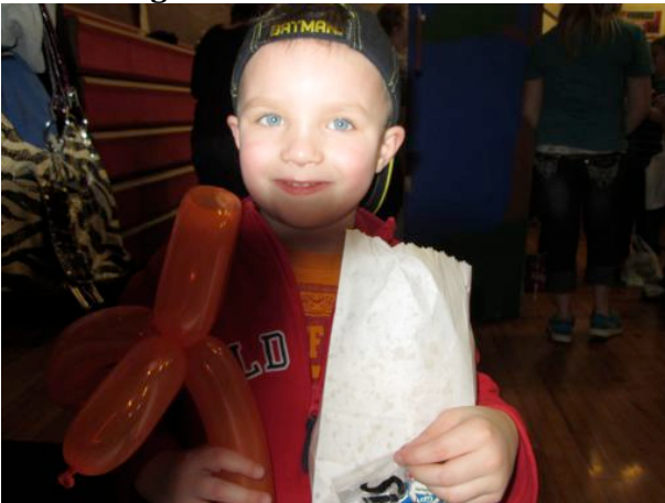
Popcorn and balloon art put a smile on this face. He knew there was more to come.