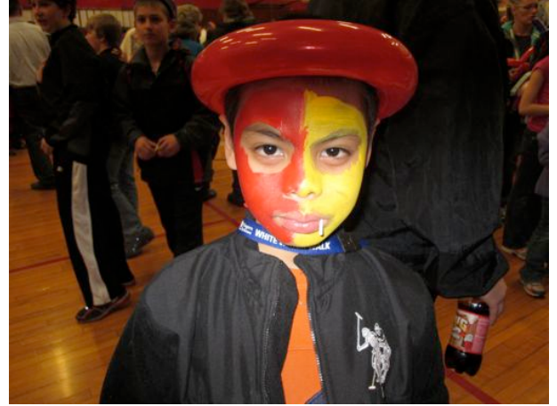
A little face paint and balloon art make for a festive Carnival attire.