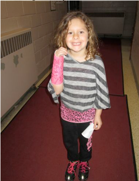
A cast on the arm doesn't dampen her spirits!