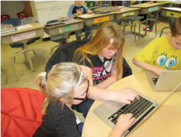
Fourth grade authors: Stop by our bulletin board south of the elementary office and read the fourth grade Fairytales.

April 4 - Grades 3 - 4 Carnival Skating Party