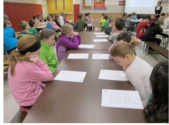
Through this project, 4th grade students will design, build, test, and collect and display data from skimmers during the fourth quarter.

On Wednesday, March 20<sup>th</sup>, the three fourth grade teachers assumed their roles as codirectors of the Earth Toy Design Incorporated. They had their first meeting with their engineers to launch the STEM Project. Students listened attentively as they explained the three roles that each would have an opportunity to play throughout this project. They are: Project Engineer, Facilities Engineer, and Test Engineer.