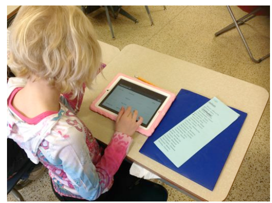
This fourth grader is practicing a literacy skill on an iPad.

New Hampton Elementary used their Chickasaw Open funds to purchase five iPads and covers for student use in grades 2, 3, and 4. With additional grant funding they were able to purchase three more iPads and covers bringing the total to eight. Teachers use the iPads in centers as another engaging resource for students to use to reinforce and practice math and literacy skills. In addition, students put their inquiry strategies to work and conduct research through the use of the iPads.