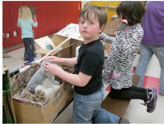
The kindergarten students spent their time at the Kindergarten Zoo looking for their parents and friends so they could show off their animal habitat.