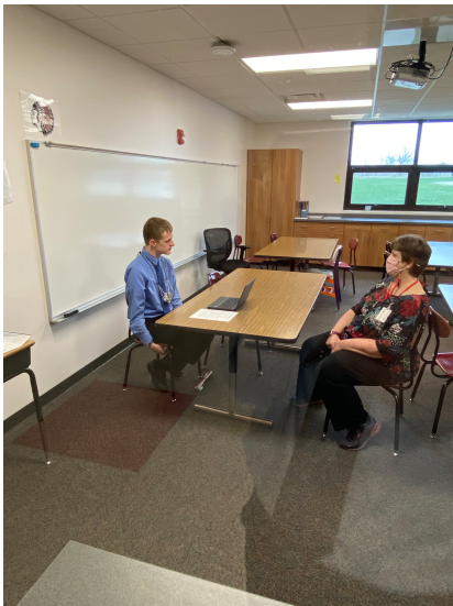
Pictures: (New Hire, Zoom Interviews, and Medical Professional Speakers)