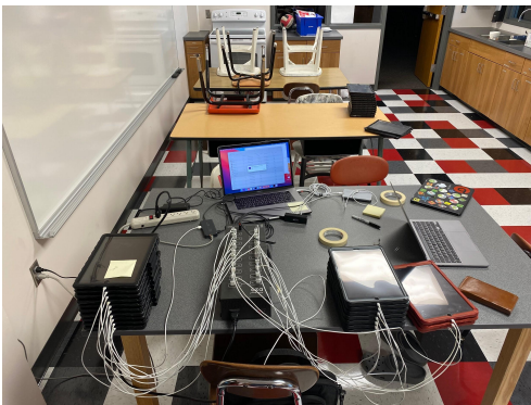
*Charging new iPads.