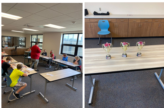
Students had fun participating for the trophies.