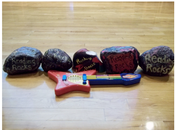
Reading Rocks Prizes: Who will the winning classrooms be this year? The ultimate prize, the plastic guitar, goes to the class that reads the most minutes each year. The finale of Reading Rocks will be held on Thursday, March 6 th in the auditorium.