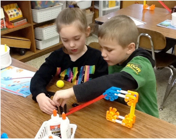
Push, Pull, and Roll: These kindergarten students are involved in a STEM unit. They were so engaged; they didn't look up when I snapped this picture.