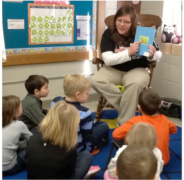
TK Storytime: TK children enjoy storytime everyday. Their interactive discussion includes questions and predictions readers and listeners have as they enjoy a good story.

A huge thank you to all of the parents who provided food on both Monday and Thursday for the elementary and middle school teachers. The food was delicious and so appreciated.