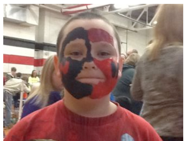
The perfect face for a Chickasaw!