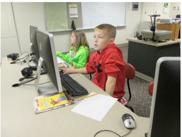
MAP Test: This spring, second graders are taking the Measures of Academic (MAP) test for the very first time. Second, third, and fourth grade students take the reading, mathematics and language arts test. Third graders also take the science test.