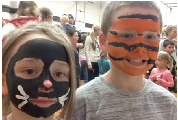
A brother and sister stopped by the registration table to share the artwork on their faces.