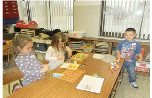
The hour in kindergarten was great fun!