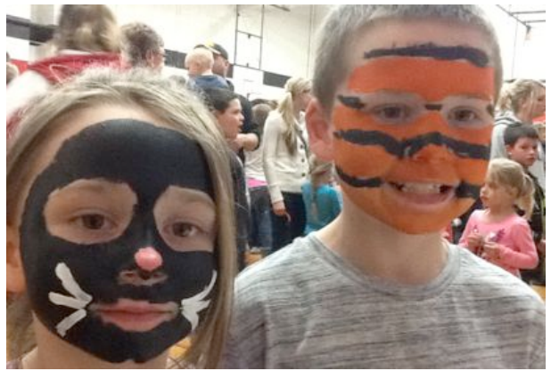
A brother and sister stopped by the registration table to share the artwork on their faces.