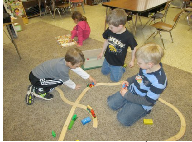
Kindergarten Initiation: On April 24<sup>th</sup>, the TLC 4's and the TK students spent an hour in the kindergarten classroom just to see what it was like.