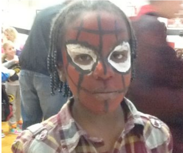
Who is this happy face?