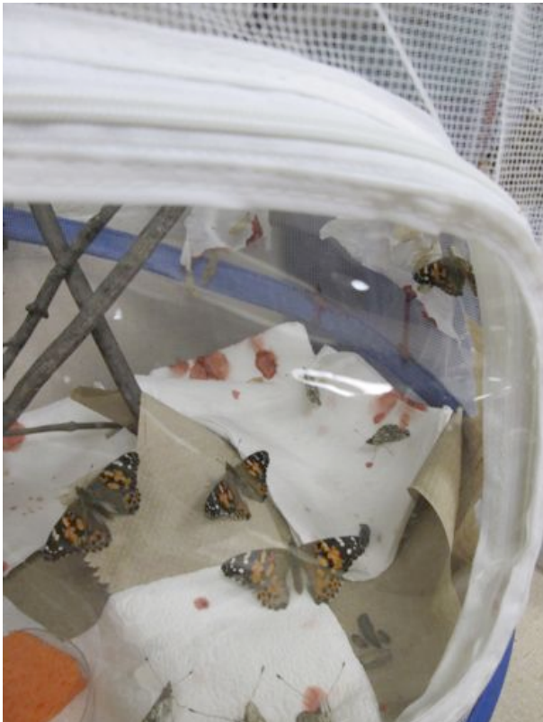
A STEM Study: Second graders have truly enjoyed their study of the life cycle of a butterfly. They were able to observe the process and learn about each stage.