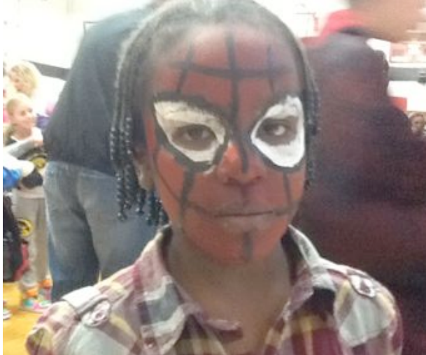
Who is this happy face?