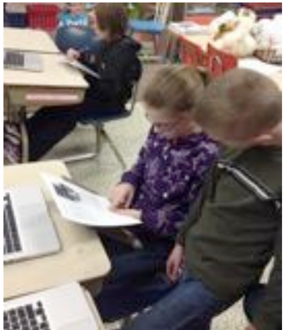
Third Graders use technology to learn all they can about Native Americans. They are especially interested in the Chickasaw tribe.