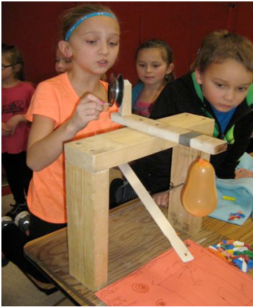
This third grader is showing a young student how to use a simple machine to pop a balloon.