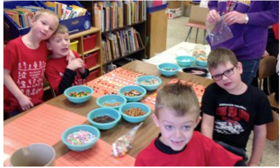
Kindergarten students loved the 100 th day activities, including making 100 th day trail mix.