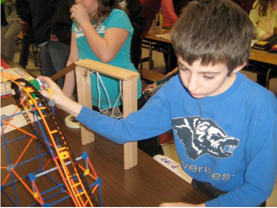
Third Grade Scientist: This third grader looks like a true scientist as he reviews his simple machine project.