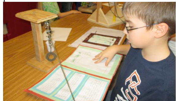
Third Grade Scientist: This third grader looks like a true scientist as he reviews his simple machine project.