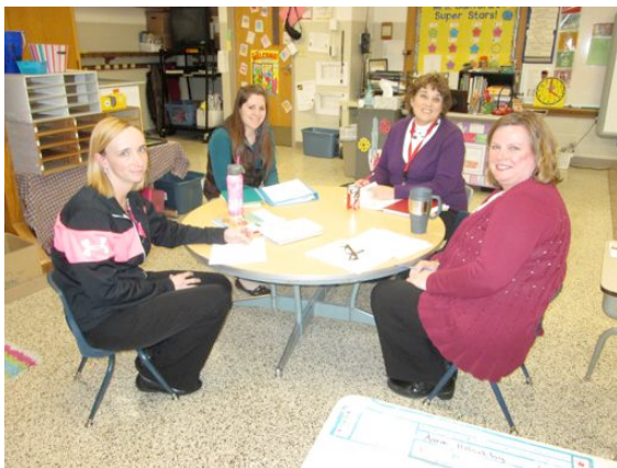
The first grade teachers meet together as a Collaborative Learning Team after school. Professional development time is valued by NHE educators.

This year, professional development takes place during late starts, on other designated days on the calendar, and during collaborative learning team sessions after school. Key to grade level training and instructional planning is the