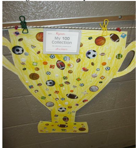
A trophy bearing many items from the sports arena now decorates the hallway.