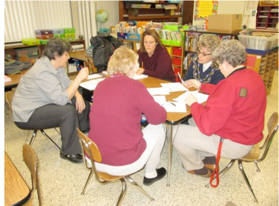
The Kindergarten Collaborative Learning Team is reviewing DIBELS Next data at this session.

Collaborative Learning Team time. Grade level CLT’s meet an hour a month after school to collaborate, review data, explore new technologies, learn current research, and improve instructional practices.