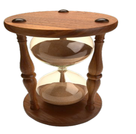
Daylight Savings Time ends on November 4<sup>th</sup>. Remember to set your clocks back.

American Education Week is November 18<sup>th</sup> – 22<sup>nd</sup>!