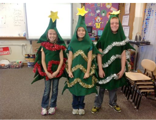
Twinkle and Shine: NHE's Christmas Program, December 9<sup>th</sup> in the high school gymnasium