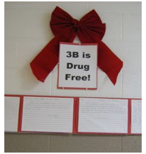
Drug Essays: The third graders did a super job on their drug essays and they are now hanging in the hallways of NHE.

During Red Ribbon Week, the students were involved in writing essays, decorating the building and community, visiting with a police officer, and attending a Ronald McDonald Assembly.